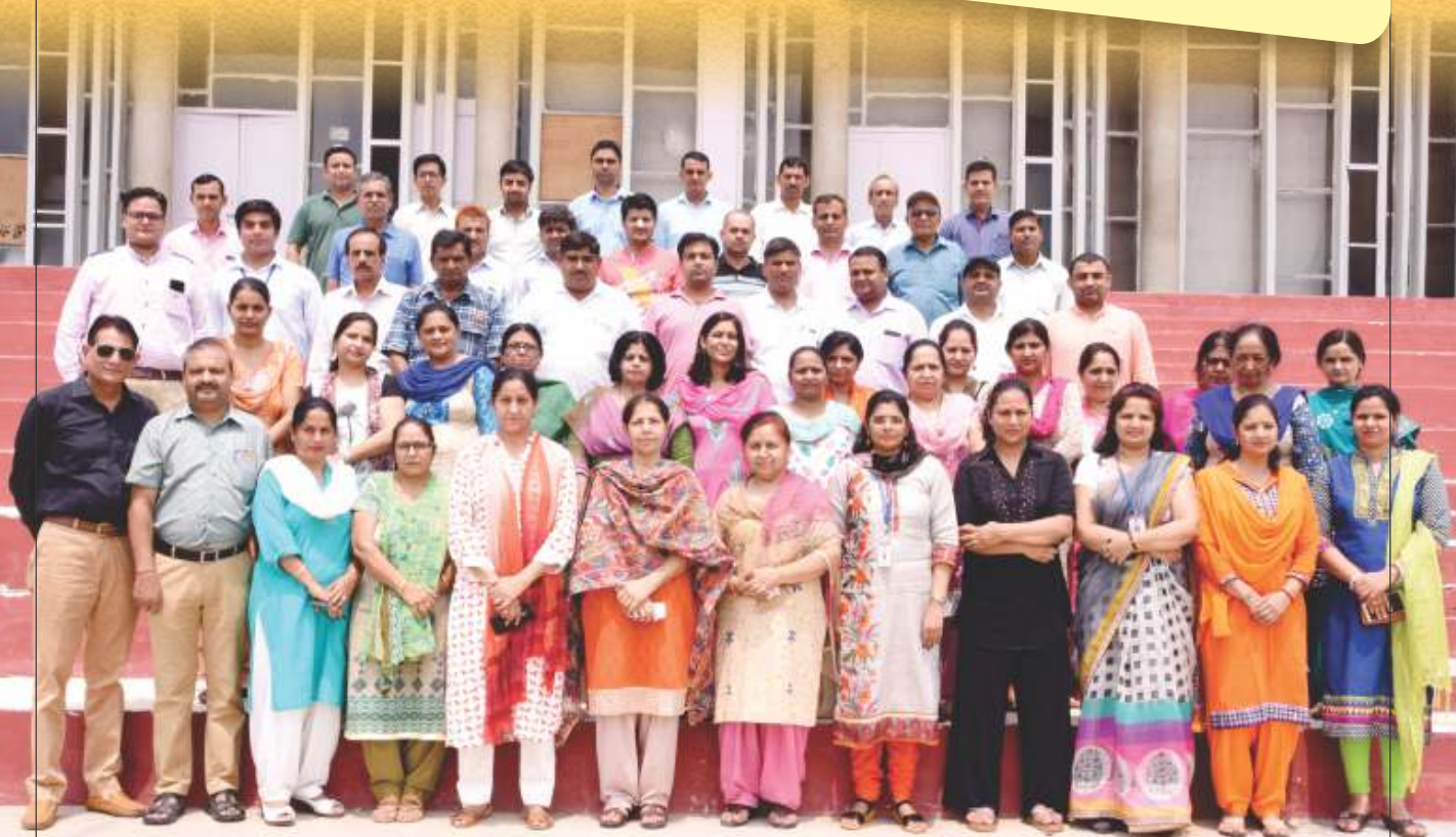
Team of Directorate of Distance Education, Kurukshetra University, Kurukshetra

To evolve a seamless system of higher distance education for sustainable life-long learning and up gradation of knowledge and skills by use of innovative approaches.